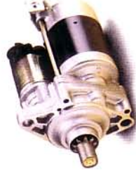
Remanufactured Starter Motor

The Honda remanufacturing process involves a complete disassembly, full-scale cleaning and inspection of every component. Parts not up to our specifications are replaced with new Honda Genuine Parts.