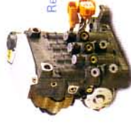
Remanufactured ABS Modular Assembly