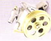
Remanufactured Power Steering Pump

Every Honda Genuine Remanufactured Part comes fully backed by our nationwide, 3 year, 36,000 mile replacement parts warranty.* And unlike many other parts warranties, ours includes labor.** Which means, with Honda, you'll receive a total "no cost" replacement – one of the best warranties in the business.